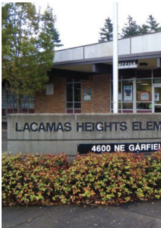
Lacamas Heights Elementary School